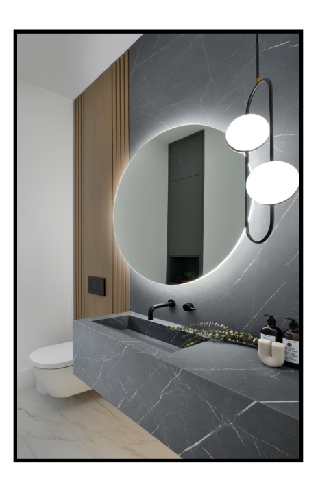
ABOVE: Statement lighting and a wall-mounted vanity with a backlit mirror create a sophisticated and modern appeal. LEFT: Dramatic lighting, curved furniture and pops of black create the modern aesthetic Elio and Nicole envisioned. BELOW: The entryway is clean-lined and architectural with natural stone and wood blending seamlessly.