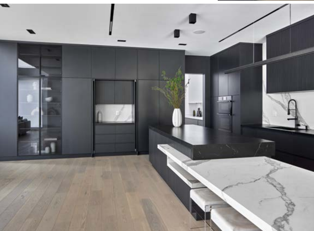
TOP LEFT: A custom wall rack displays wine and is easily accessible while hosting parties. ABOVE: Dark cabinetry and appliances were chosen to offset the white walls and light flooring. LEFT: The ultimate in kitchen décor: a hidden pocket door hides the pantry and smaller appliances, keeping the kitchen's appearance clean and tidy.