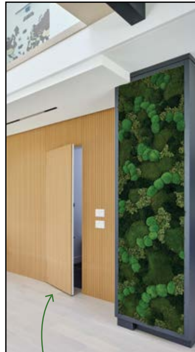
Fluted walls conceal a secret door that leads to the hidden mudroom and powder room.